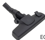
ECO floor tool